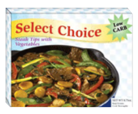
Figure 1. Depiction of labels used in the FDA Experimental Study of Carbohydrate Claims on Food Packages Analysis Report.

In late 2005, they sent the mentioned 600,000 households screening questions in order to collect more information about their diet status. Approximately 173,000 households responded to their questions, roughly indicating a 29% response rate, relatively poor compared to some recent web-based recruiting efforts [4]. A total of 9,700 participants were included in the study, with a minimum of 180 participants per product and label condition.